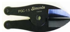
PGC-1.5—PLASTICS ONLY FOR SM-50 and SM-55 ONLY