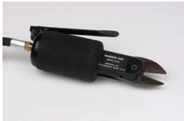
SP-02P with optional PGC-7 jaw

SP-01P and SP-02P are designed to use all of the jaws below. The SP-01P is further designed with a built in adjusting screw which controls the opening of the jaw sets. Manufactured to high standards from aluminum, these power packs can easily be mounted on EOAT for robots, benches or can be used manually by hand.