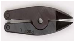
PGC-1CH (Use w/MSP-1 )

Power packs are priced and sold less jaw sets.