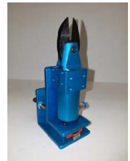
Power Packs designed for use on automated machines and robots

Replacement jaws may be purchased separate from housing. All Simonds jaws are able to be re-sharpened at the factory.