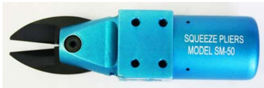
SM-50 with Optional PGC-1.5 Jaw