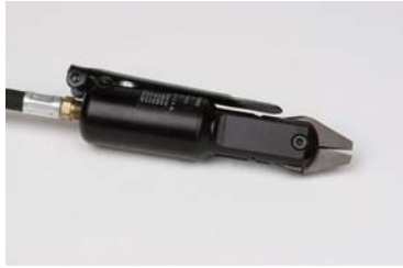
MSP-1 with optional jaw