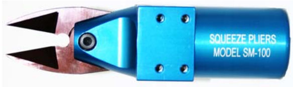
SM-100 with Optional PGC-2CH Jaw Optional Jaws on Page 3

The SM-100, SM-55 and SM-50 Robotic/Automatic power pack was designed for automation. Fitted for solenoid activation, these are versatile tool. The square mounting block allows the tool to be attached to existing or new automatic machines. Light weight in design these tools fit easily on to robotic EOAT. All of these features, along with optional jaws makes these some of the most powerful and versatile tools in the industry. (These tools use the optional jaw sets shown on page 3).