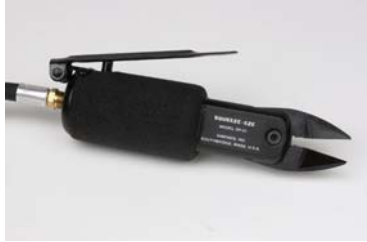
SP-01P with optional PGC-2CH jaw

The MSP-1 is our miniature power pack, for use with our PGC –1CH jaw set (see below). Made of durable aluminum, the tool is small (5" long x 1 1/4" diameter) lightweight (8 oz.) and can be operated at air pressures of 60-80 psi. A built in adjusting screw controls the opening of the jaw sets. All Simonds jaw sets are easily re-sharpened at the factory