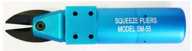
SM-55 with Optional PGC-1.5 Jaw