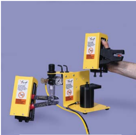
Easy module change

Fits a variety of pliers, cutters, crimpers, strippers, pop riveters, scissors, snips and other pivoted hand tools from about 5" to 12" (125 mm—300 mm) long.